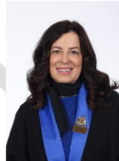
Carmel Noon Central Ward Councillor